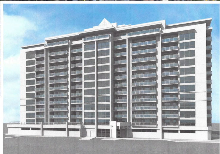
RENDERING FOR PROPOSED 147 UNIT HIGH-RISE