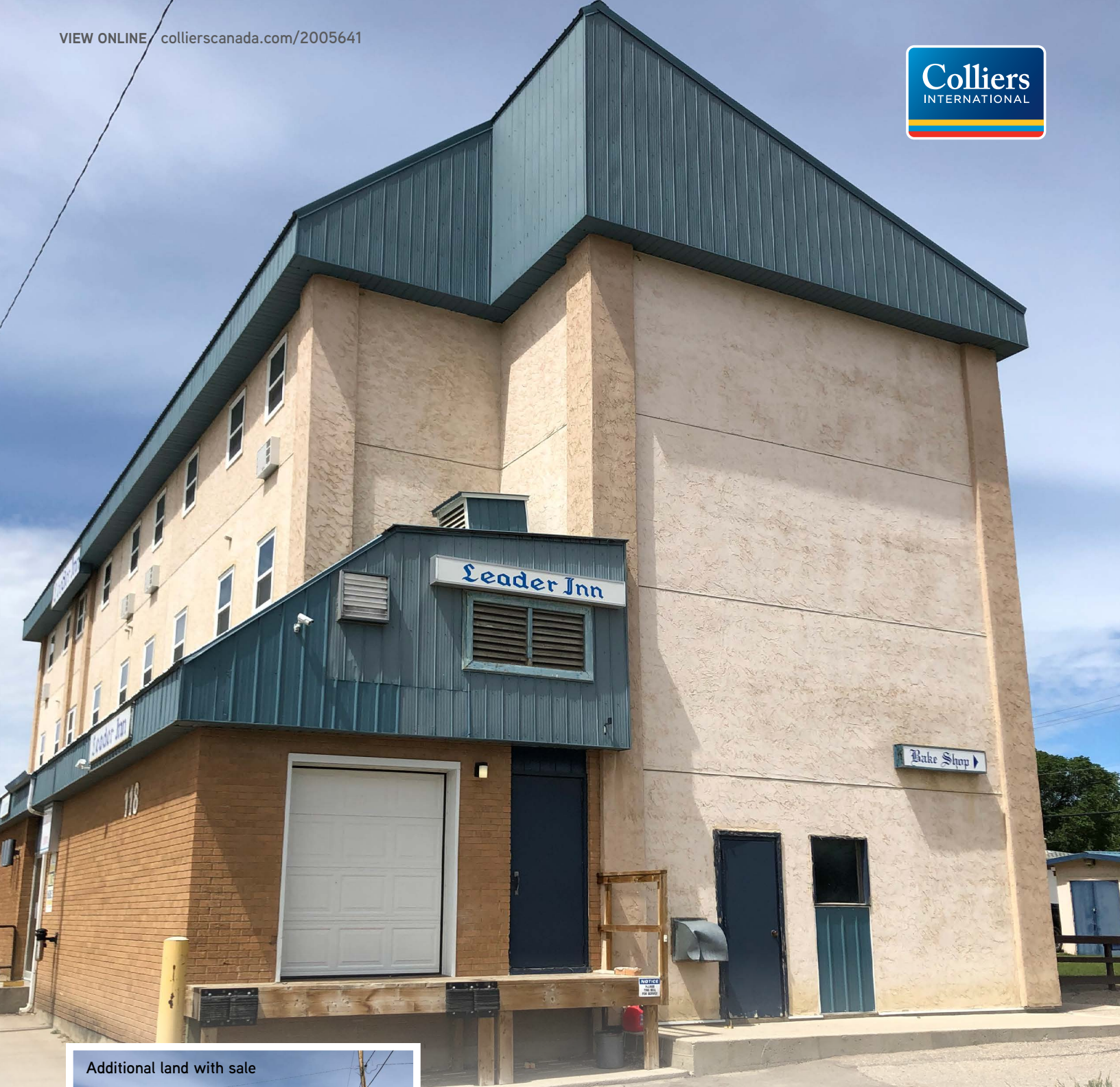
Additional land with sale