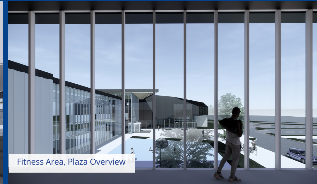
Fitness Area, Plaza Overview