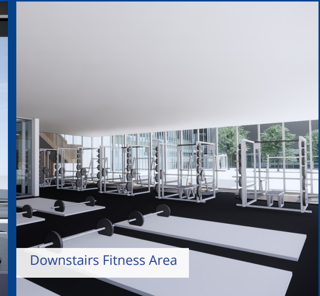
Downstairs Fitness Area