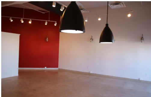
UNIT 2C: 1,474 SF