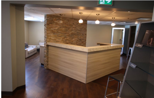
UNIT 2A: 4,435 SF