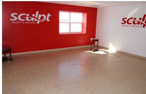
UNIT VIC: 922 SF