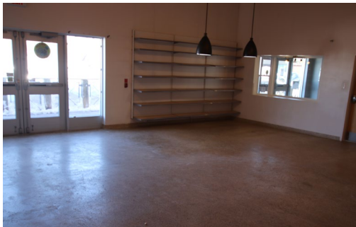
UNIT 2C: 1,474 SF