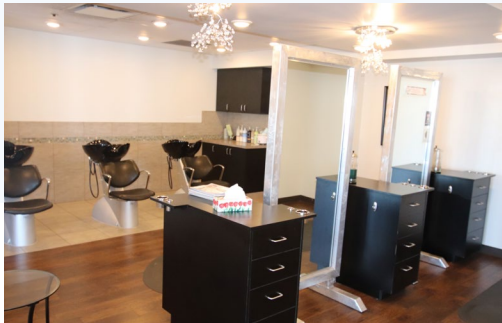
UNIT 2A: 4,435 SF