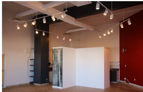
UNIT 2C: 1,474 SF