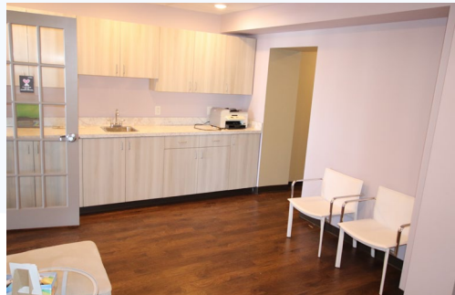
UNIT 2A: 4,435 SF