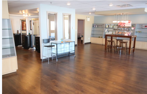
UNIT 2A: 4,435 SF