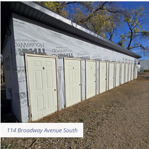
114 Broadway Avenue South