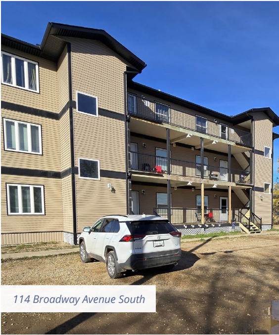
114 Broadway Avenue South