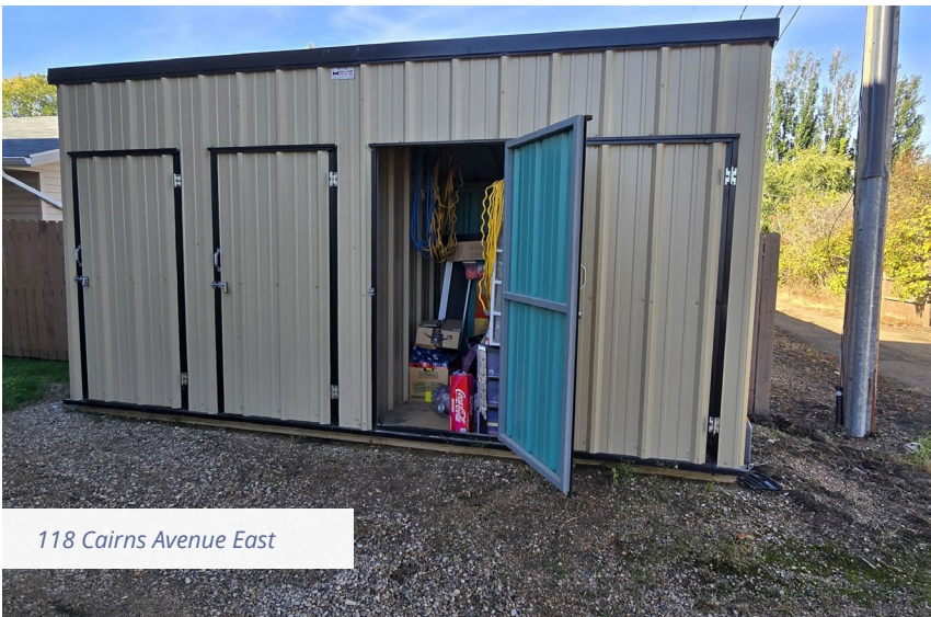
118 Cairns Avenue East