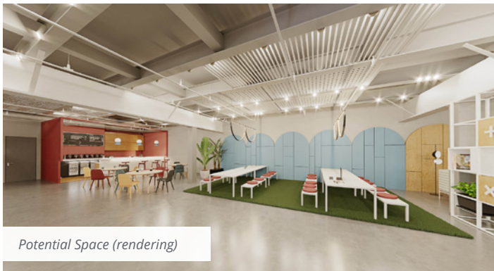
Potential Space (rendering)