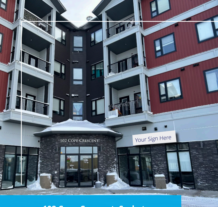
102 Cope Crescent, Saskatoon Excl.