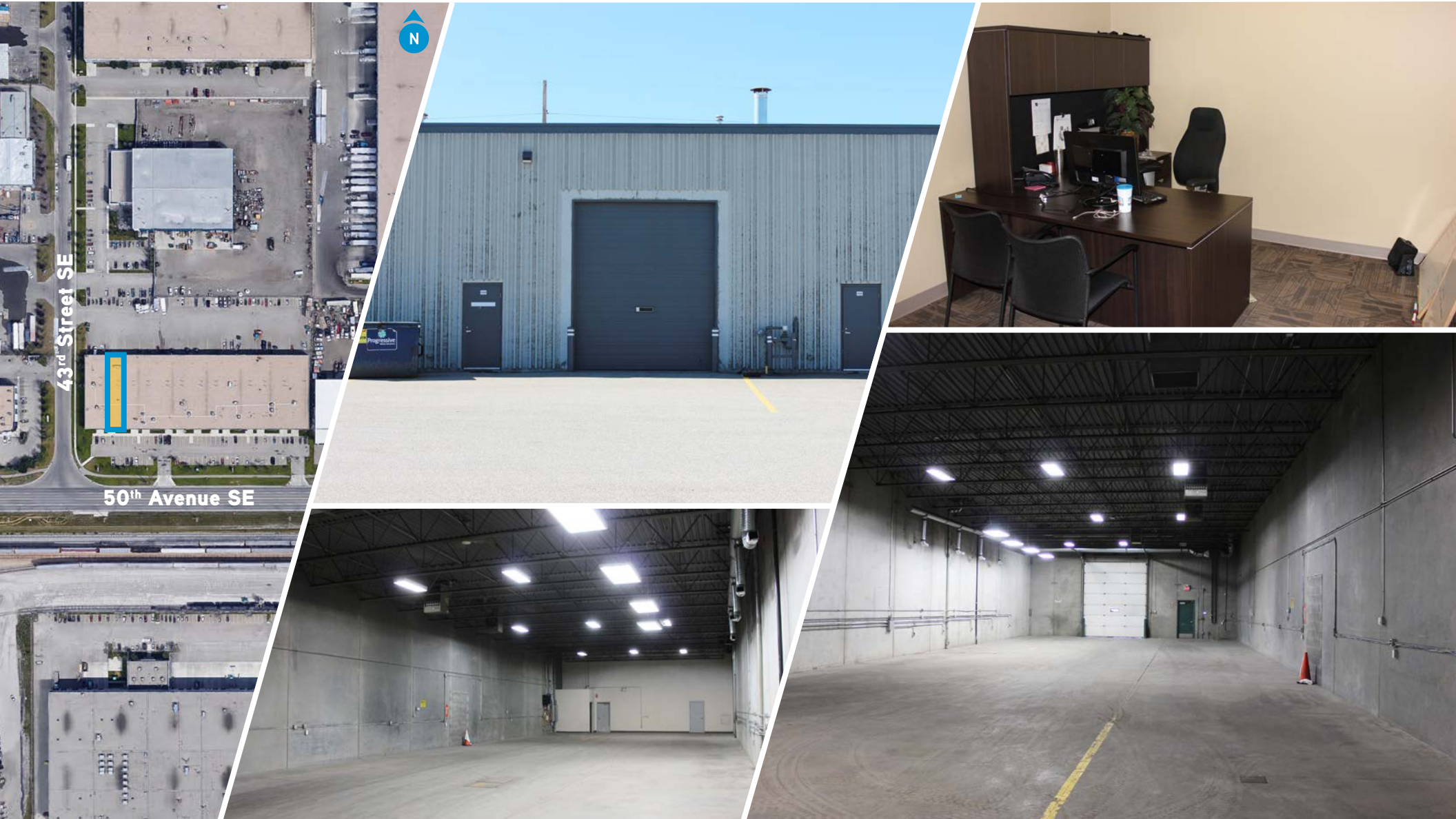
CLOCKWISE FROM TOP LEFT: Aerial of Property // Exterior Loading Area // Private Office // Warehouse Area // Warehouse Area