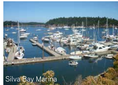
Silva Bay Marina