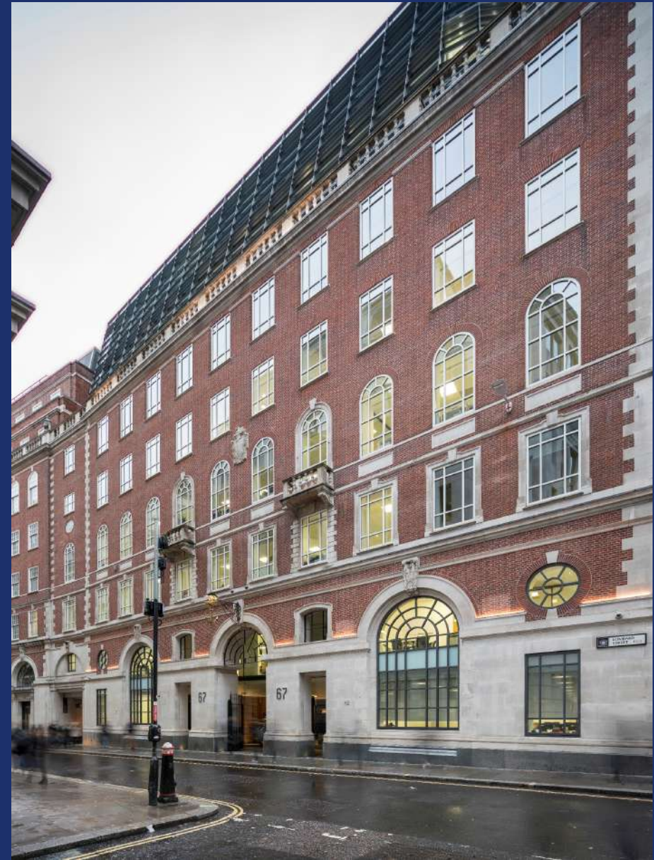
67 LOMBARD STREET, EC3