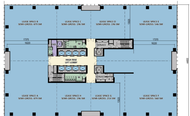
Typical High Rise