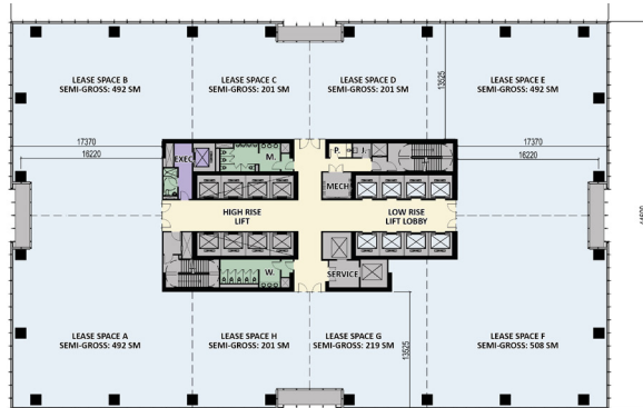
Typical Low Rise