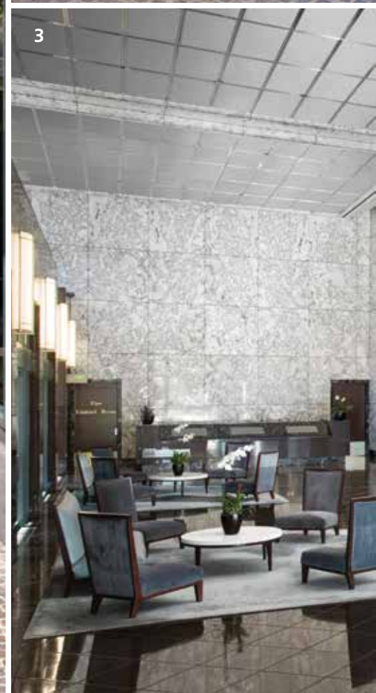
1. Entrance view | 2. Outdoor patio | 3. Lobby