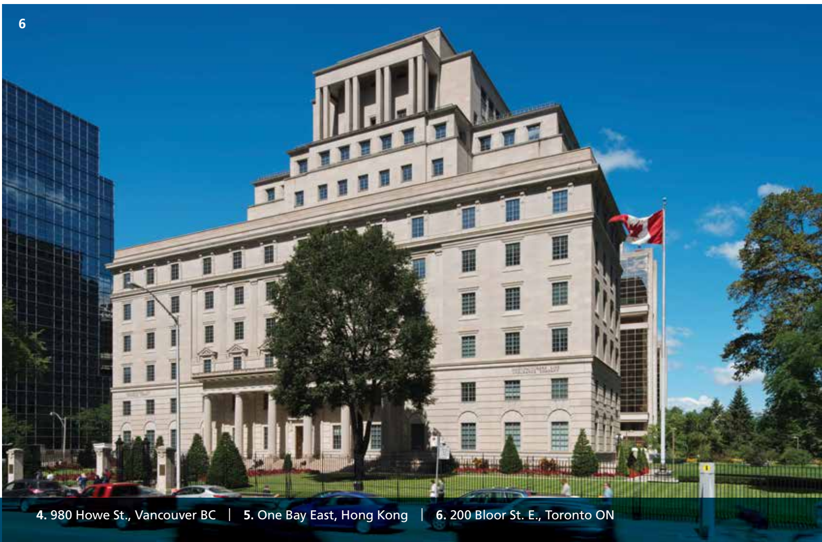
4. 980 Howe St., Vancouver BC | 5. One Bay East, Hong Kong | 6. 200 Bloor St. E., Toronto ON