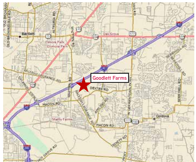
Located at 7000 Goodlett Farms Parkway just minutes from I-40 / I-240 Interchange

AGENT: LAURA P. TAYLOR +1 901 312 5772 MEMPHIS, TN laura.taylor@colliers.com