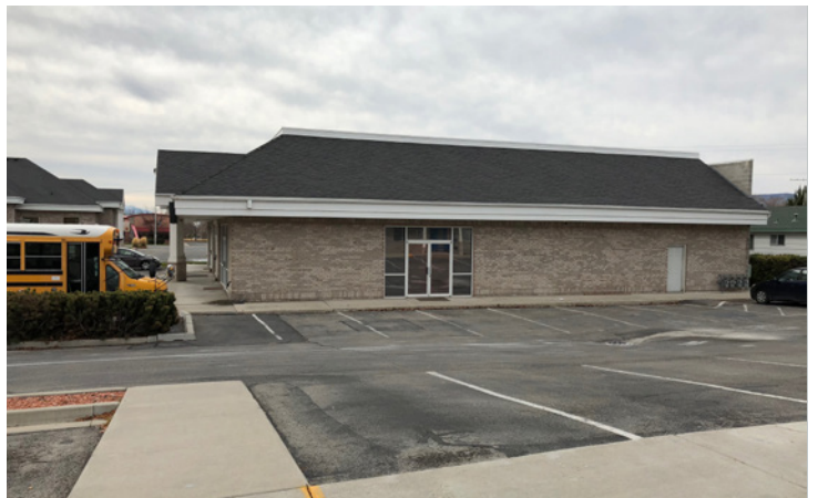
NORTH SIDE OF THE BUILDING WITH ADDITIONAL PARKING