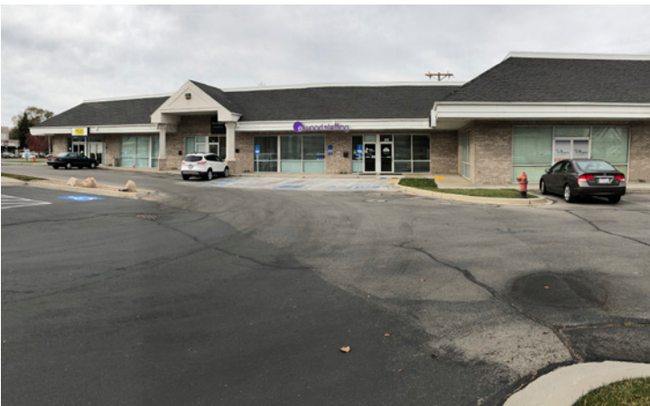
UNITS 1-7 ON THE SOUTH EAST PORTION OF THE BUILDING