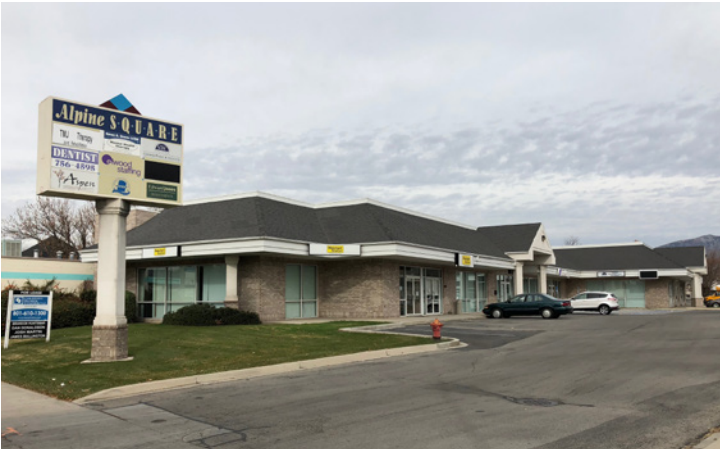
SOUTH SIDE OF THE BUILDING ALONG STATE ROAD