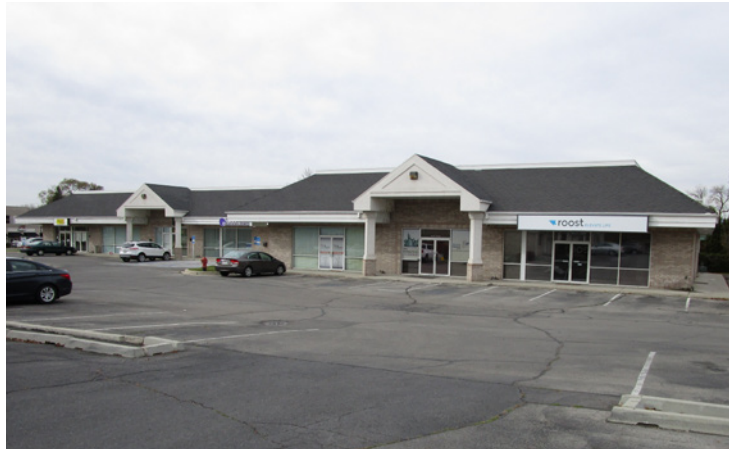
UNITS 7, 8 & 9