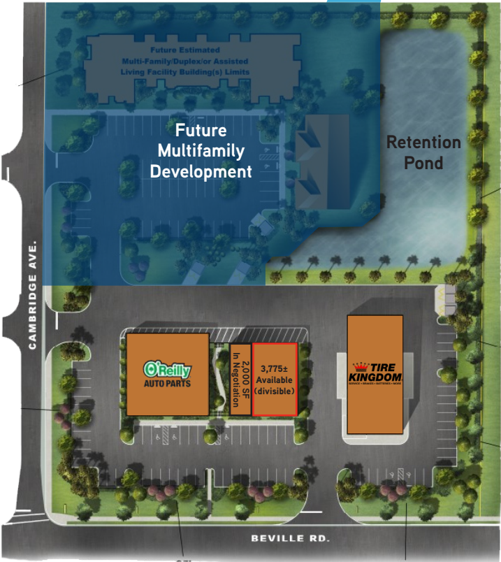
*Rendering site plan, subject to change.