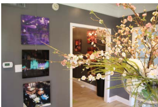
Neutral colors to enhance creativity