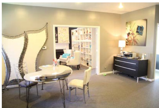
Upscale interior finishes with open concept design