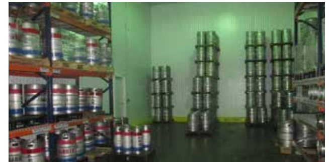
DRAUGHT HOUSE (KEG STORAGE)