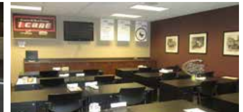
SALES AREA DOCK DOOR