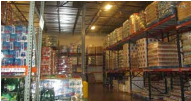
BOTTLE WAREHOUSE (NOT REFRIGERATED)