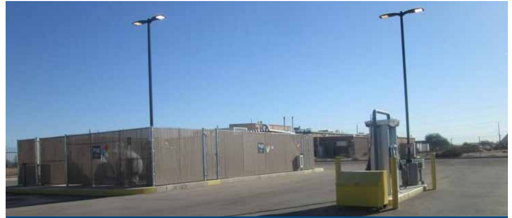
CNG FUELING STATION