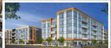
Press Building Apartments

Mixed-use residential and retail, including 253 new residential units, featuring 7,000 SF of new retail space