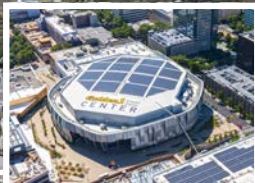
Golden 1 Center/DOCO Sports, concerts, shopping, eateries, on-site luxury hotel