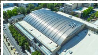
Convention Center Complex Convention center, memorial auditorium, community center theater