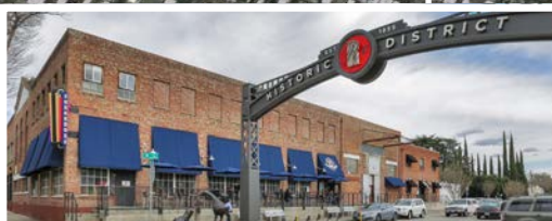
R Street Historic District - Restaurants, bars, local venues

±36,000 SF of retail, 100,000 SF of office, ±145 new urban loftss