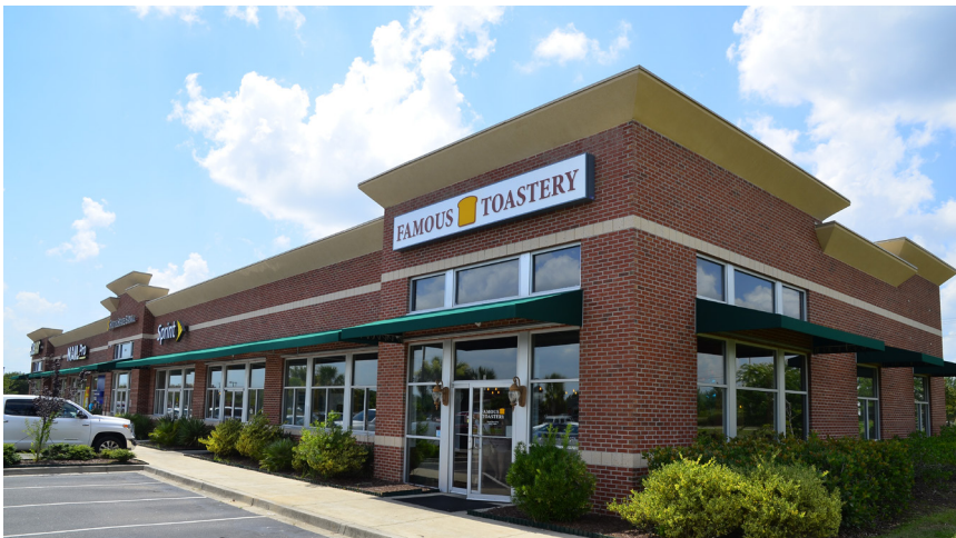
Forest Square Outparcel Exterior