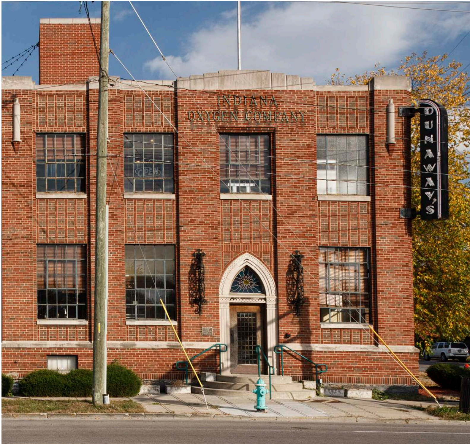
351 S. East St. Indiana Oxygen Building