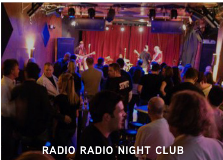
RADIO RADIO NIGHT CLUB