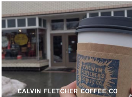
CALVIN FLETCHER COFFEE CO