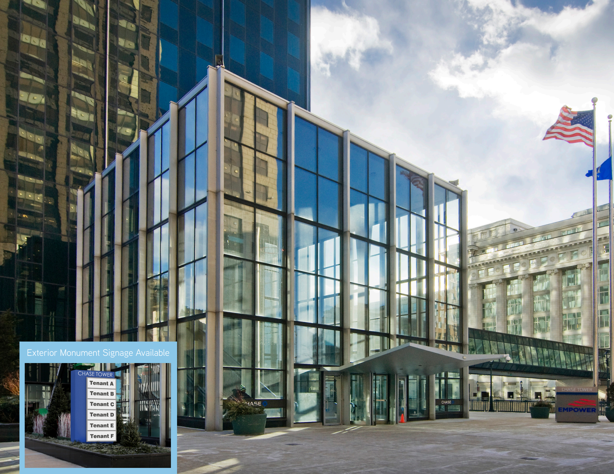
Exterior Monument Signage Available