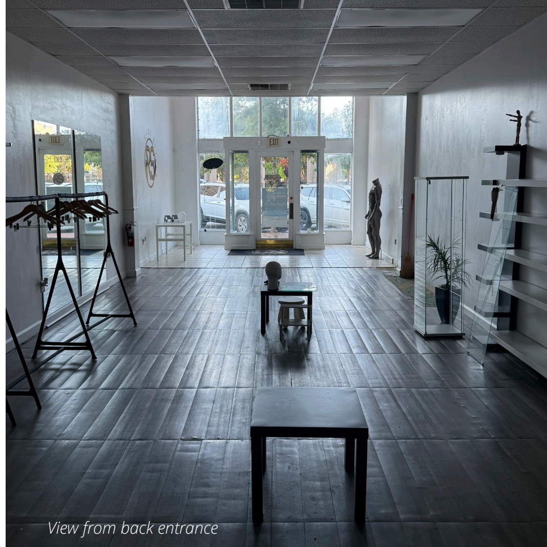
View from back entrance