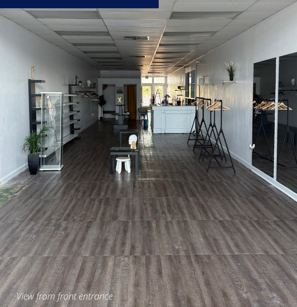
View from front entrance