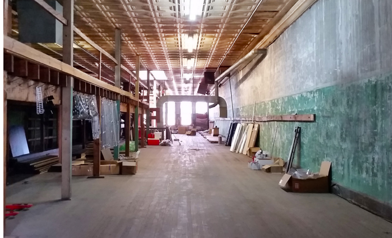
2nd Floor • Vacant/Unfinished Space