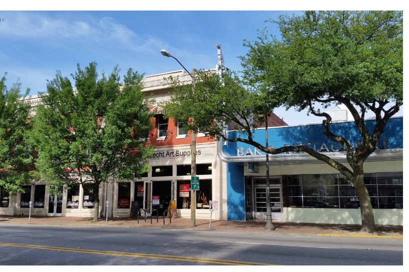
Exterior • Historic Facade