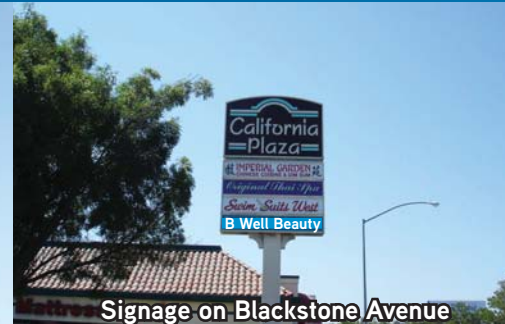
Signage on Blackstone Avenue