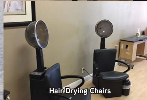
Hair Drying Chairs