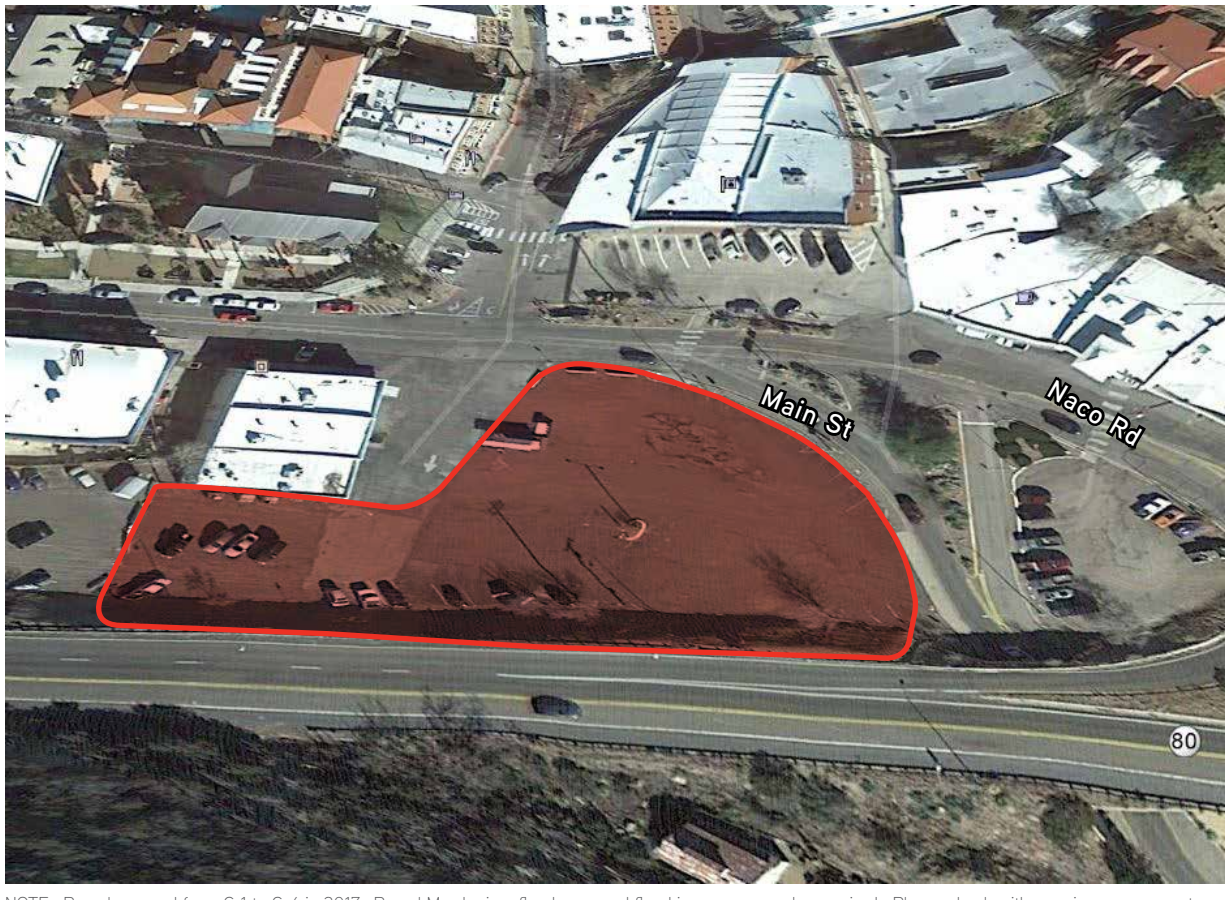
NOTE: Parcel rezoned from C-1 to C-4 in 2017. Parcel May be in a flood zone and flood insurance may be required. Please check with your insurance agent.