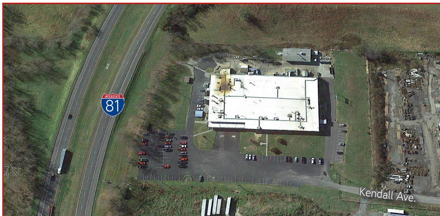
Property Road View