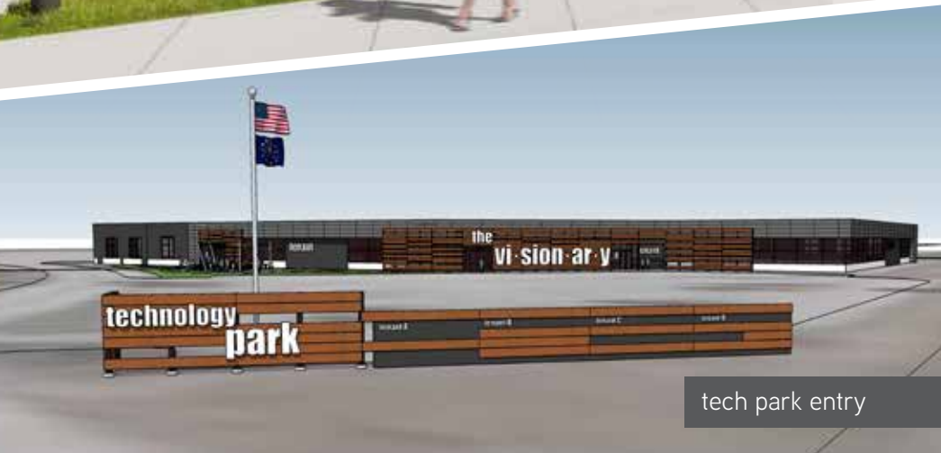
tech park entry