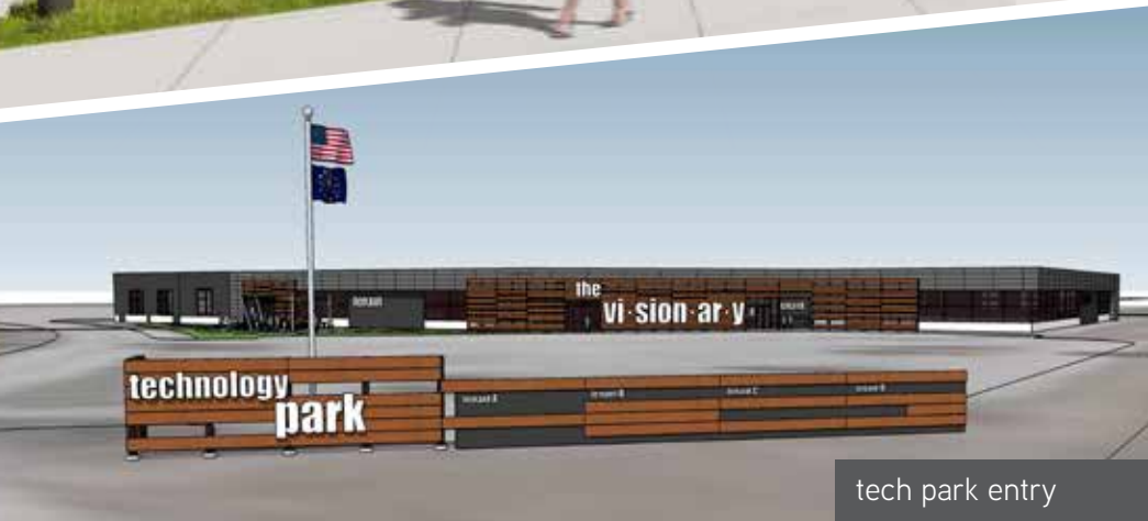
tech park entry