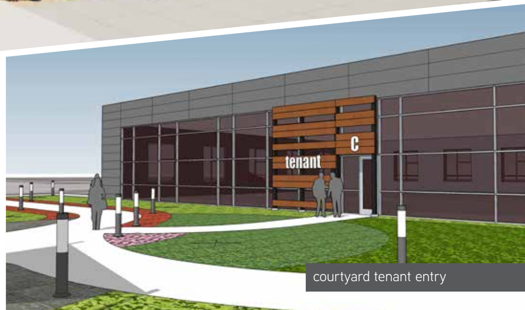
courtyard tenant entry