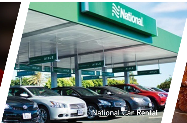
National Car Rental