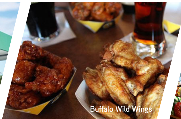
Buffalo Wild Wings