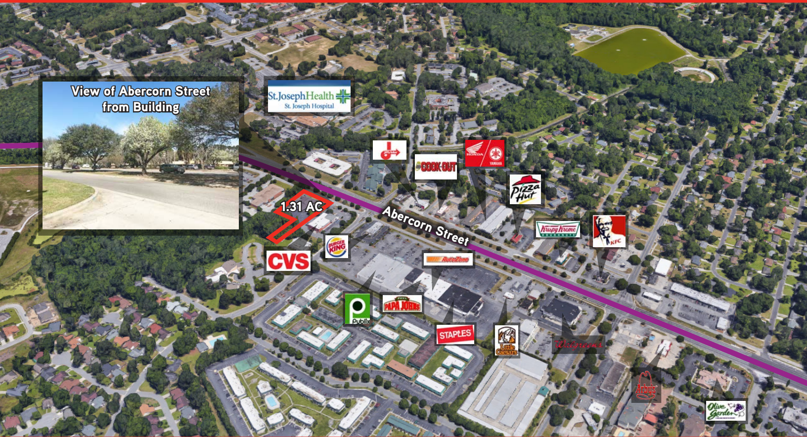
View of Abercorn Street from Building