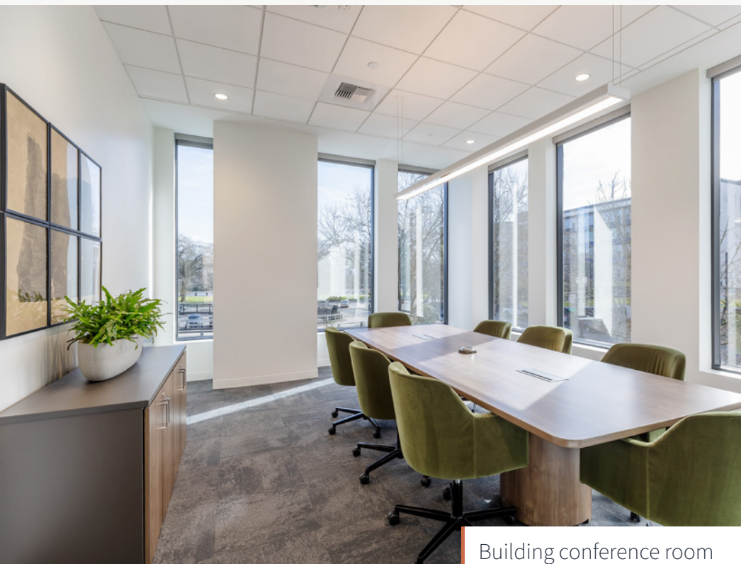
Building conference room