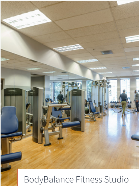
BodyBalance Fitness Studio