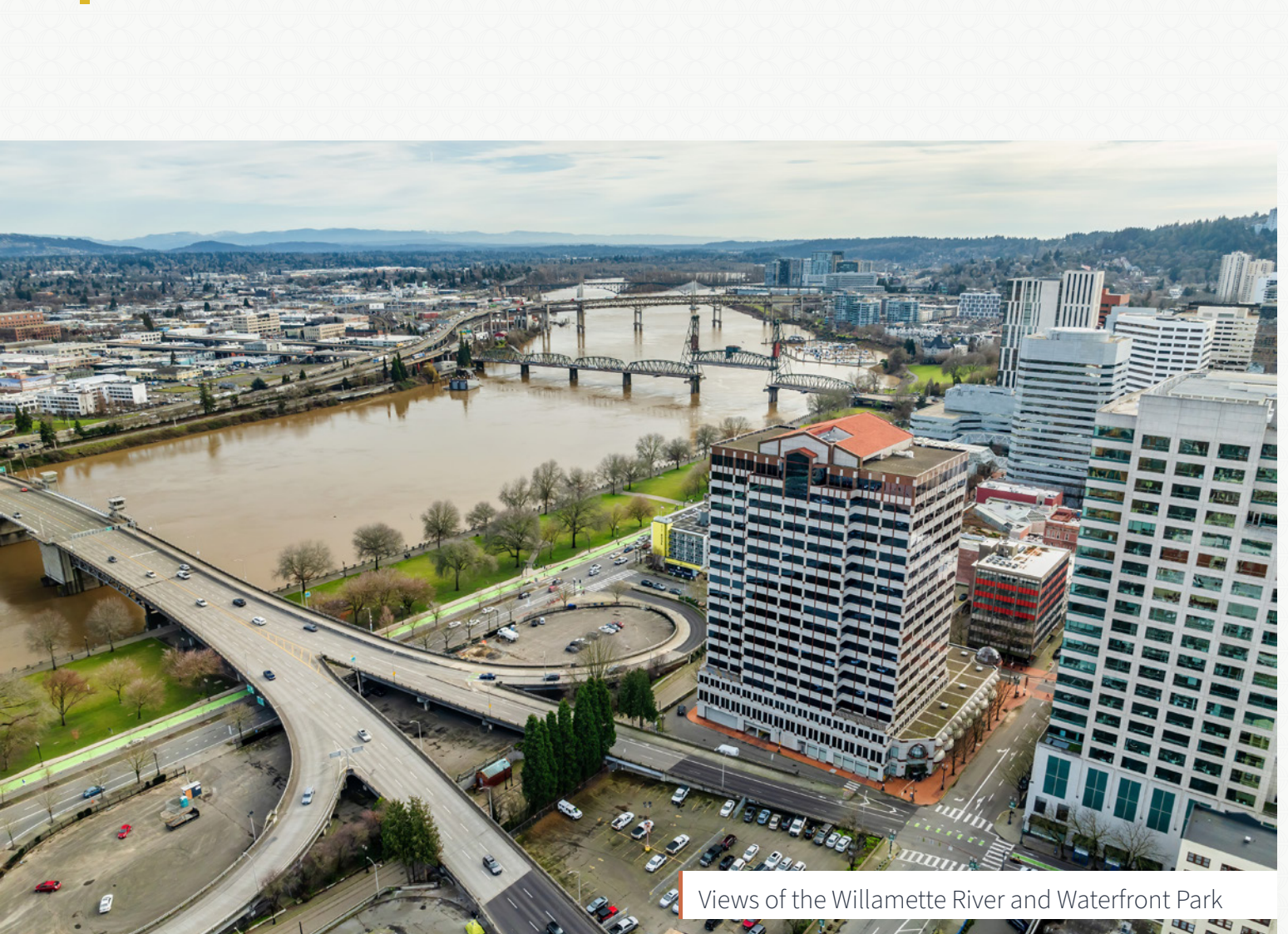
Views of the Willamette River and Waterfront Park

Set on Portland's waterfront, One Financial Center is an 18-story landmark offering expansive views of the Willamette River, Mt. Hood, and the city skyline. Its strategic location at the edge of the Central Business District ensures easy access to downtown and the lively Waterfront District, making it a prime destination for business and commerce.