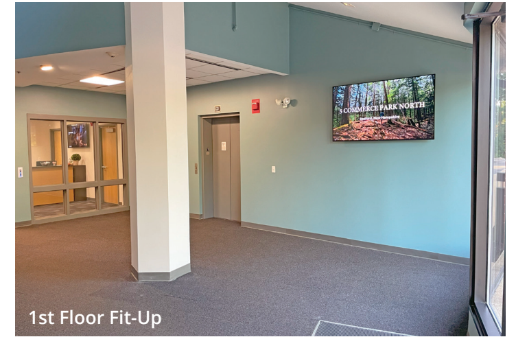
1st Floor Fit-Up