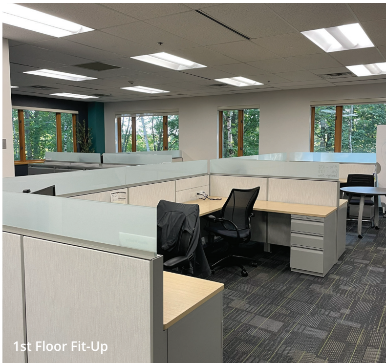
1st Floor Fit-Up