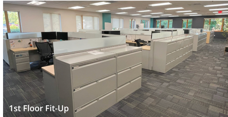
1st Floor Fit-Up