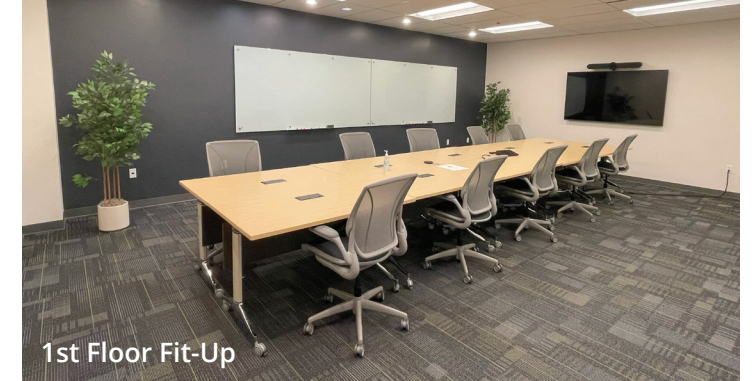
1st Floor Fit-Up