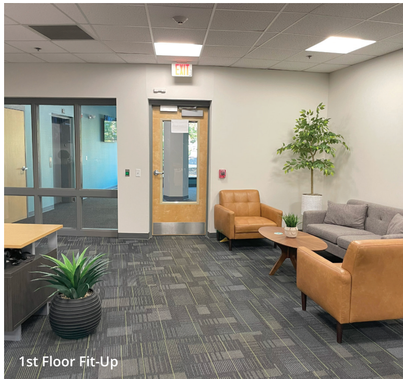
1st Floor Fit-Up