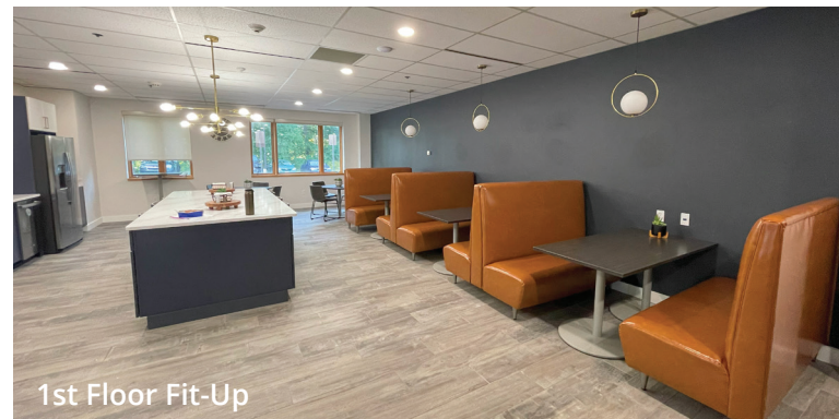
1st Floor Fit-Up