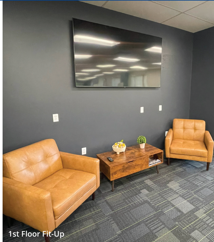
1st Floor Fit-Up