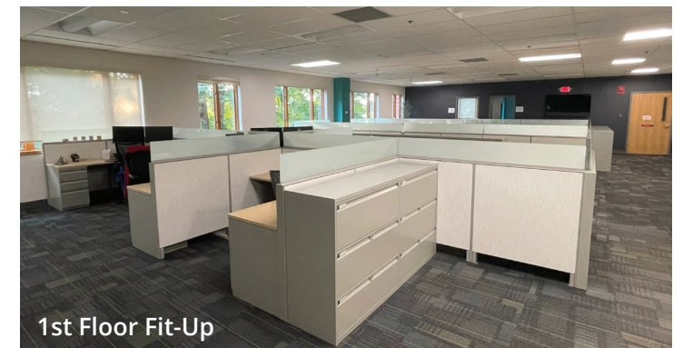
1st Floor Fit-Up