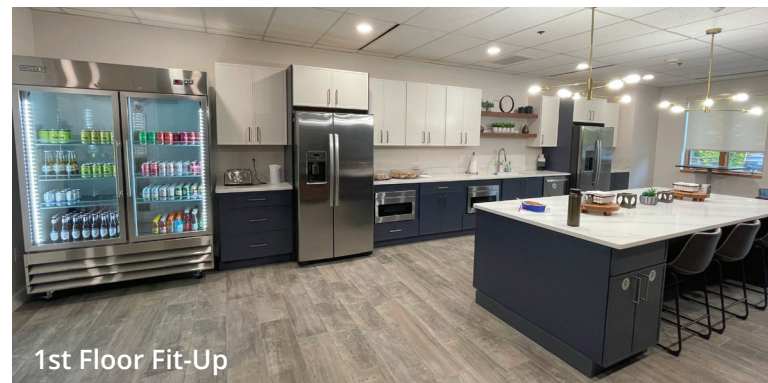
1st Floor Fit-Up