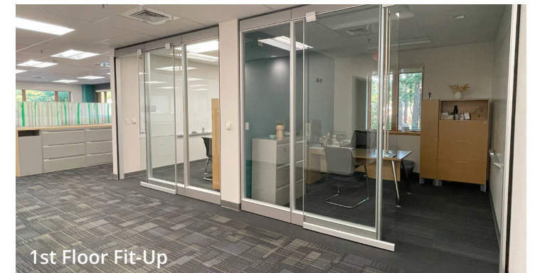
1st Floor Fit-Up