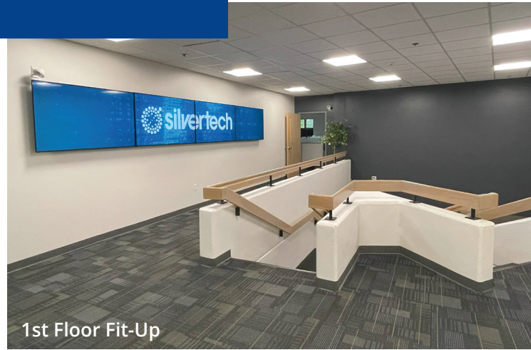
1st Floor Fit-Up