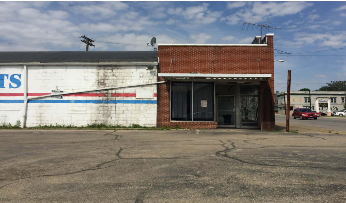
SIDE ENTRANCE / PARKING LOT