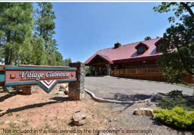
Not included in the sale, owned by the homeowner's association

Owned by the property owner's association and located in the center of the project is a festival area with ponds stocked with fish for catch and release fishing, gazebos, picnic tables, hiking trails and work-out stations. Also included is a 6,000 SF clubhouse with flat screen TVs, stone fireplaces, hardwood floors, a kitchen, rest rooms, showers, games room, internet room laundry facilities, as well as an outdoor pavilion and horseshoe pit.