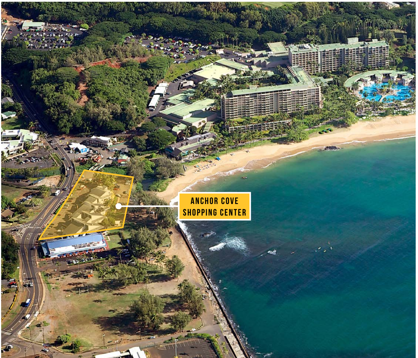
ANCHOR COVE SHOPPING CENTER