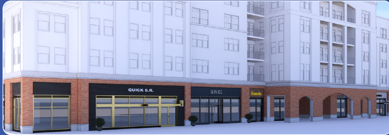
STATION YARDS STOREFRONT RENDERING