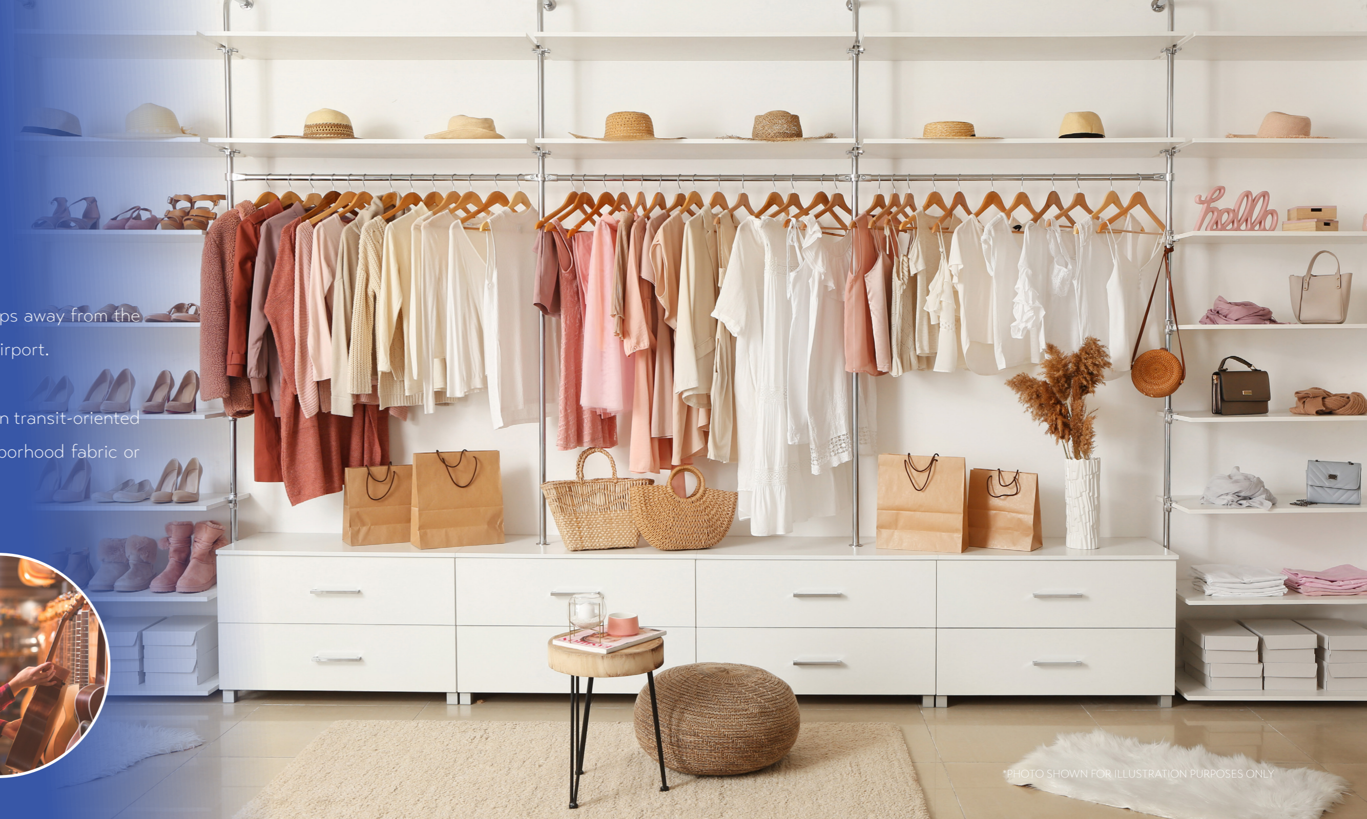
PHOTO SHOWN FOR ILLUSTRATION PURPOSES ONLY