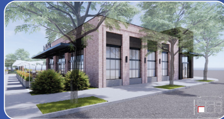
THE SQUARE - PAD SITE RESTAURANT 3,700 SQUARE FEET