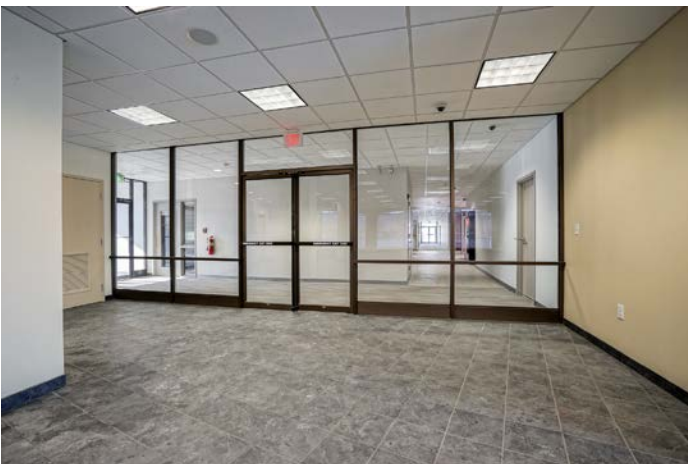
Store Front Design