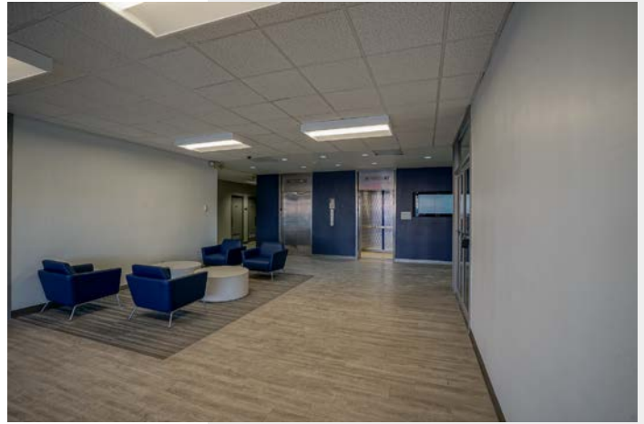
Upgraded Common Areas