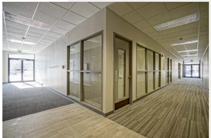
First Floor Lobby Exposure