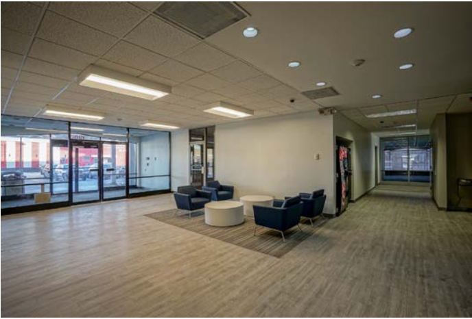
Recently Renovated Lobby