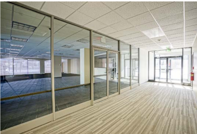
Ample Natural Light