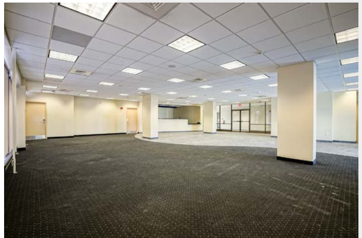
Open Floor Plans