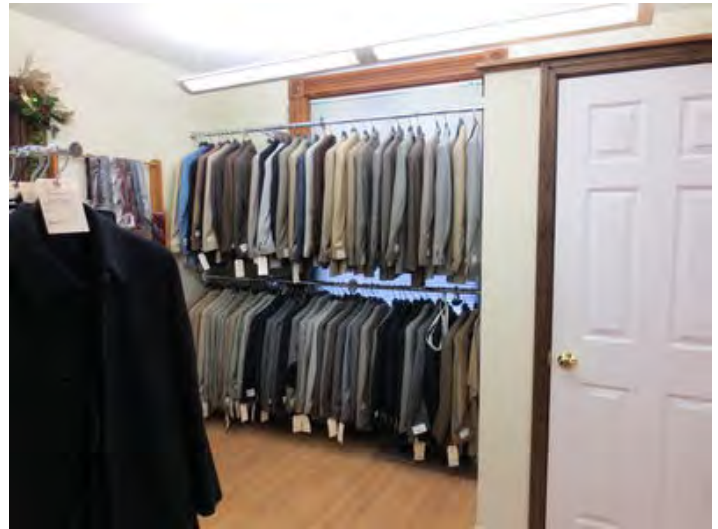
Interior View 6