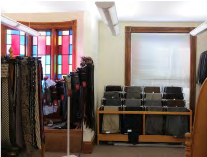
Interior View 4