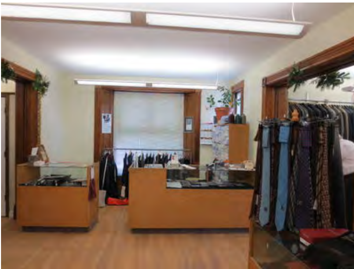
Interior View 5