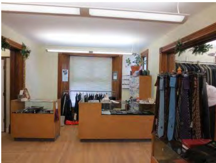
Interior View 5