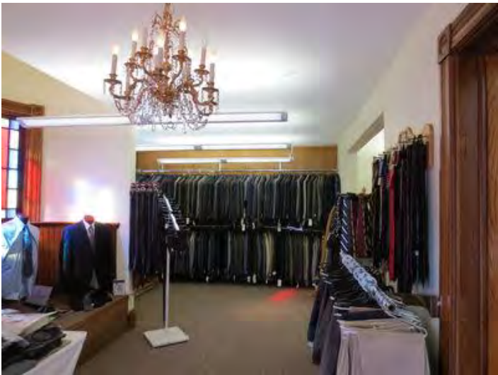
Interior View 2