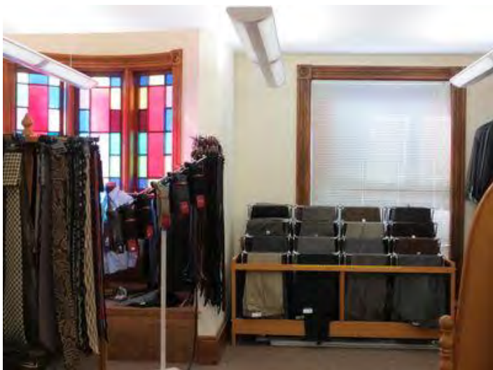
Interior View 4