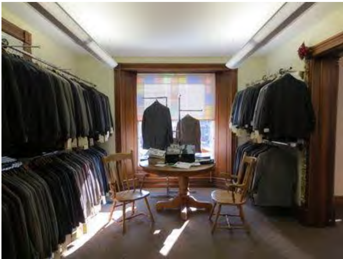
Interior View 3