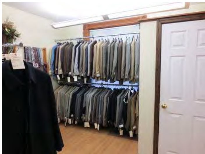
Interior View 6