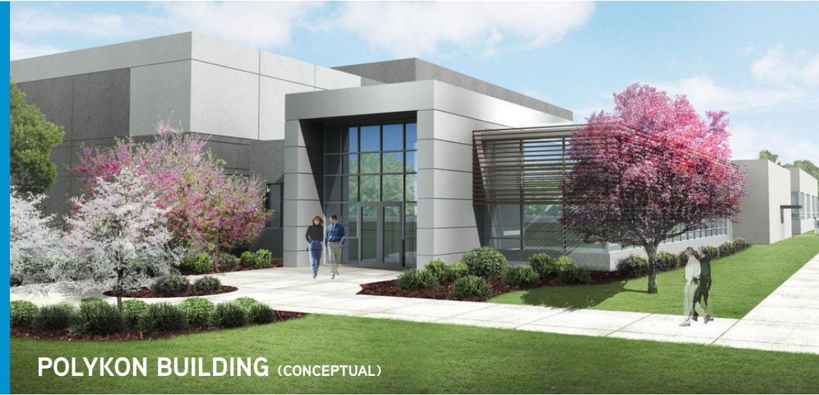
POLYKON BUILDING (CONCEPTUAL)

For Municipal Information Contact: Henrico County Economic Development 804.501.7654 www.henrico.com