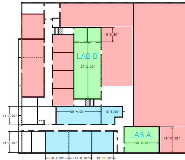
First Floor Office Space