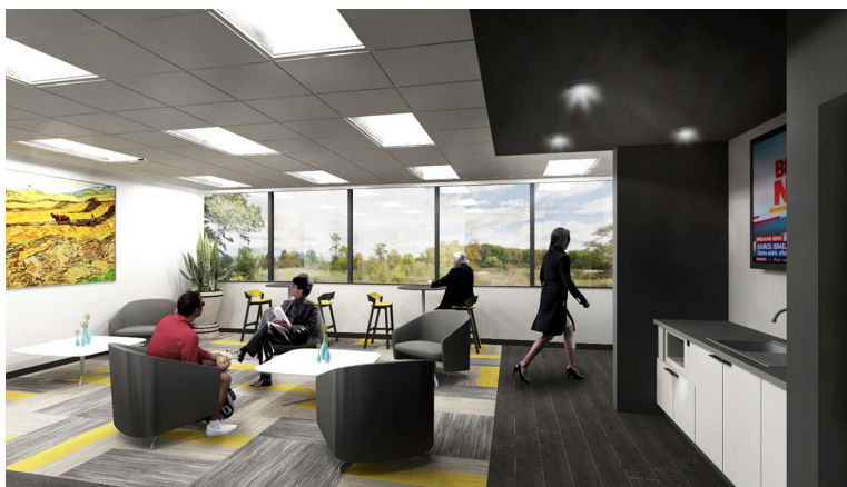
Common Area Renovation Renderings