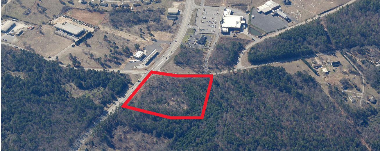
Dimensions are approximate