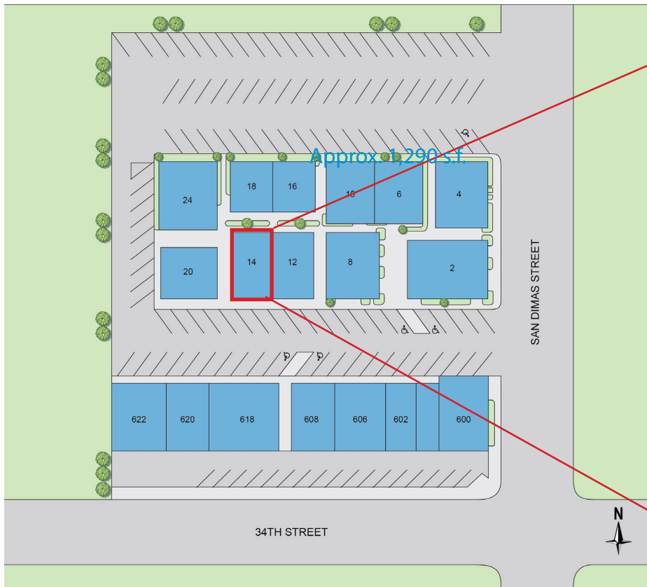
Medical Condo / Suite 14