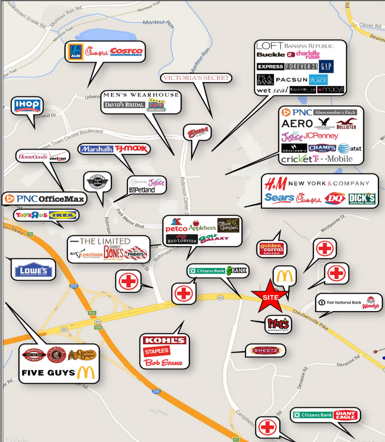
Map with site and Mall at Robinson and Robinson Town Center