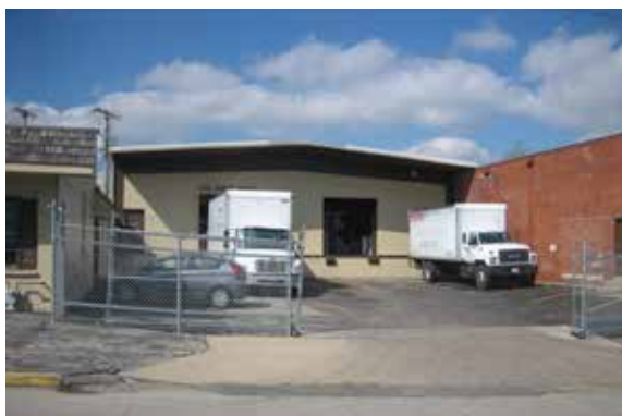
310 W 80th Street