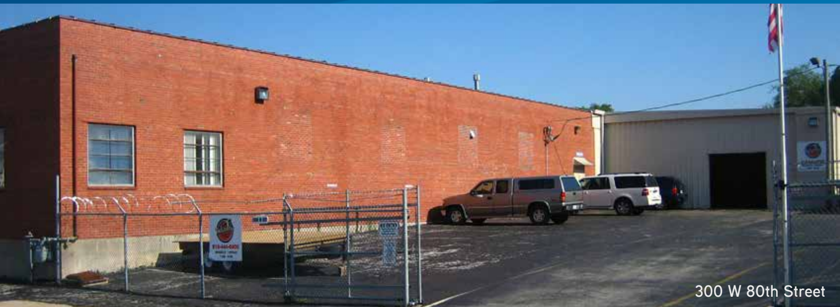
300 W 80th Street