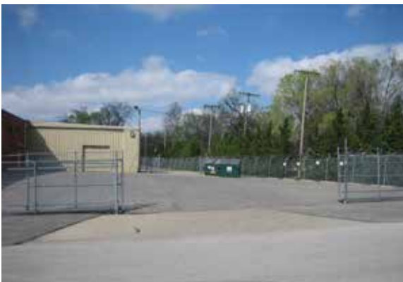
300 W 80th Street > Fenced Yard