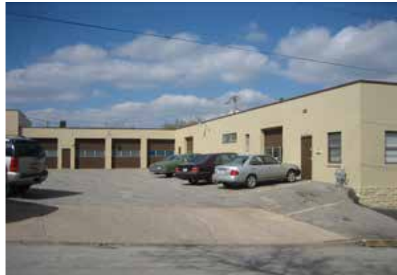
314 - 318 W 80th Street