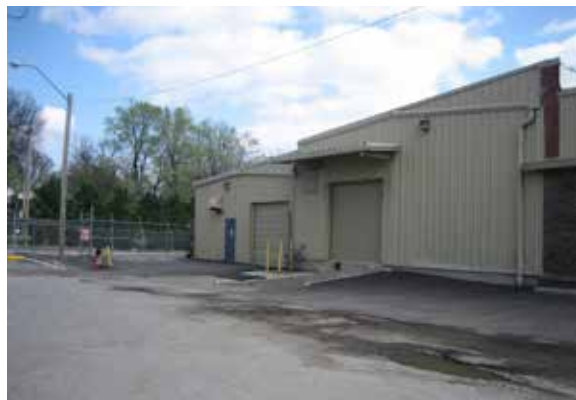
300 W 80th Street > Rear Loading