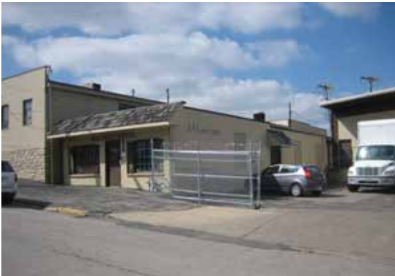
310 W 80th Street > Office