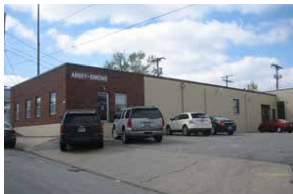
320 W 80th Street