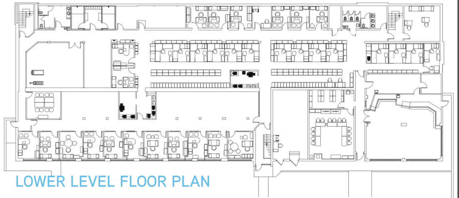
LOWER LEVEL FLOOR PLAN

COLLIERS INTERNATIONAL 200 Public Square, Suite 1200 Cleveland, Oh 44114 | www.colliers.com/ohio