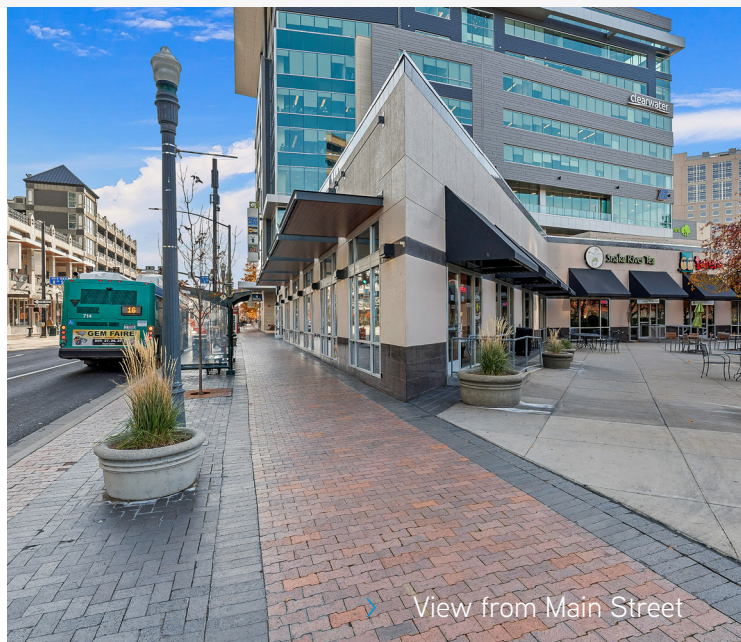
View from Main Street