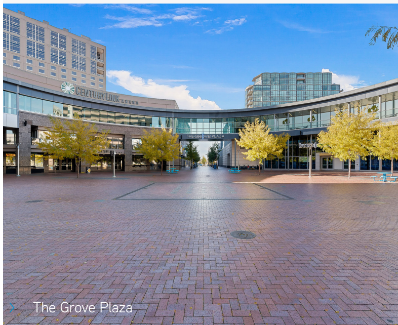
The Grove Plaza