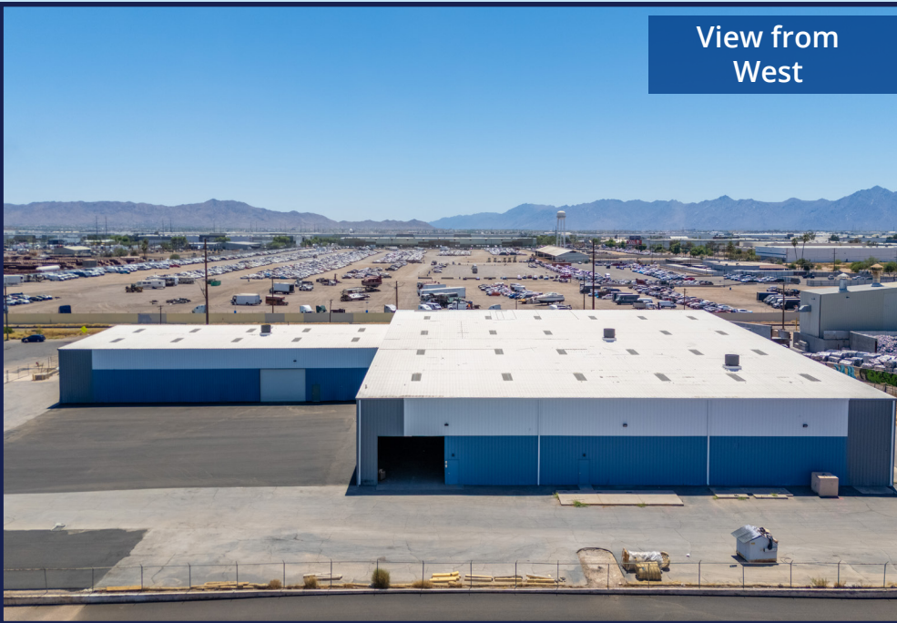
View from West