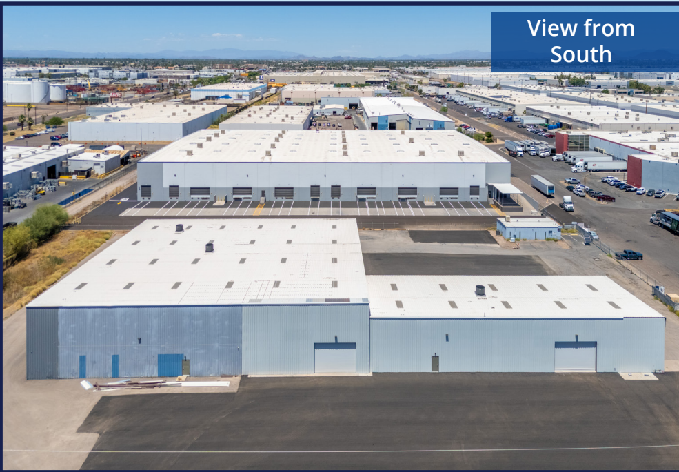
View from South