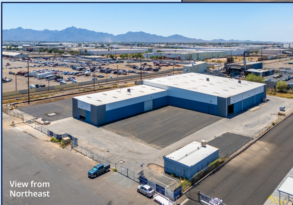
View from Northeast