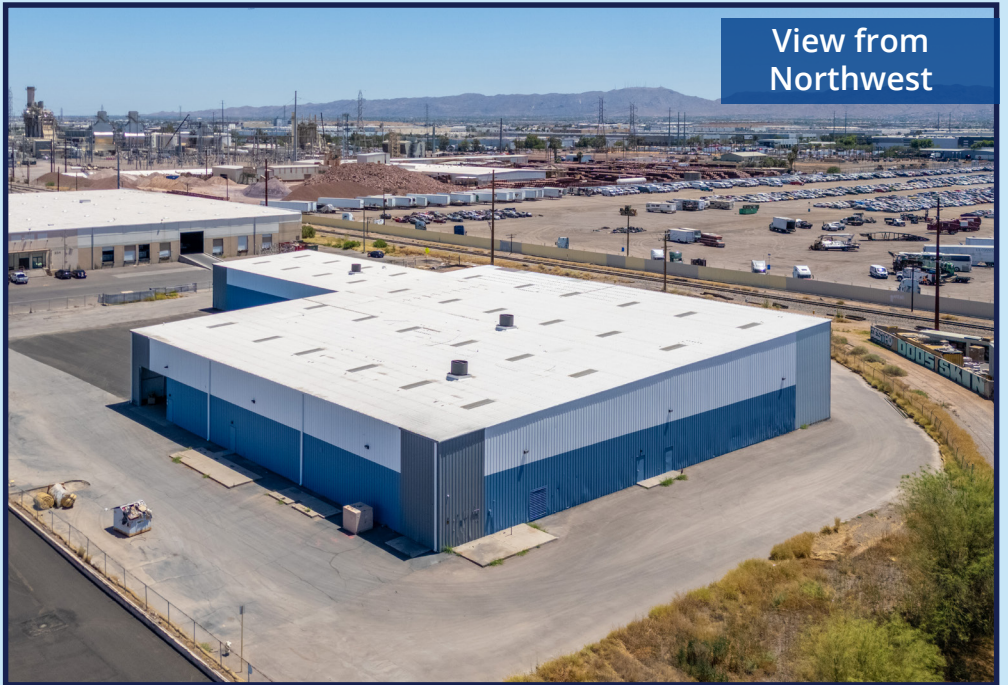
View from Northwest