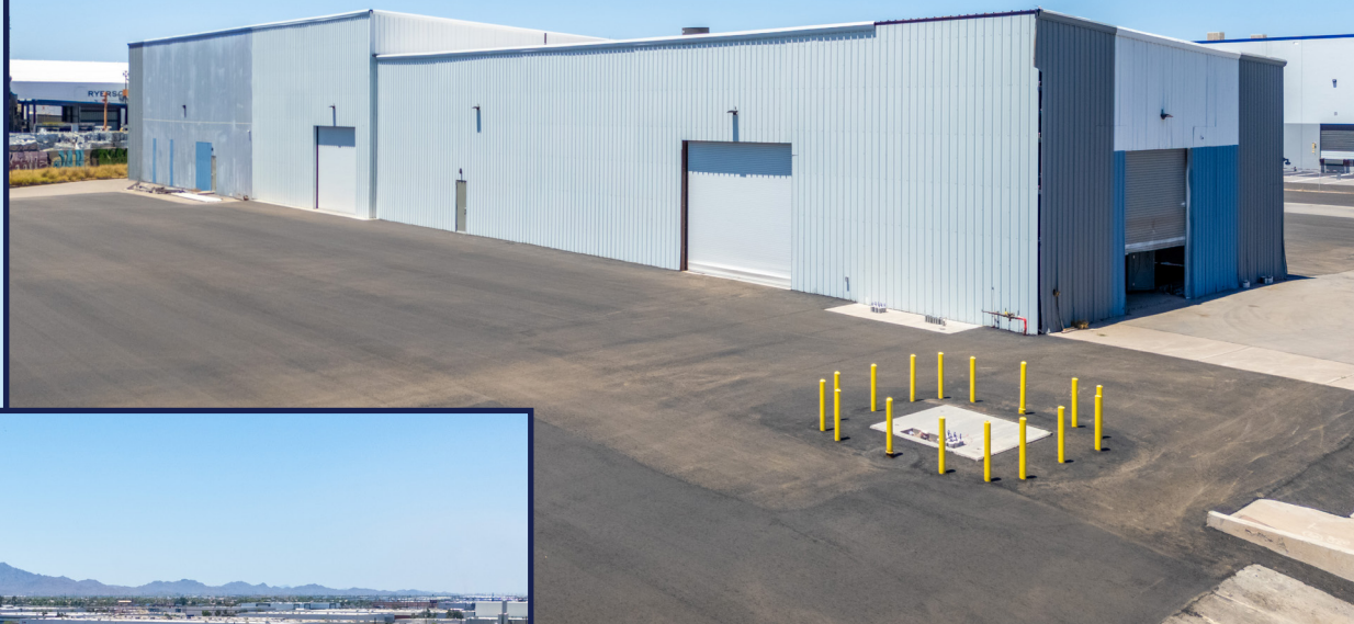
View from Southeast