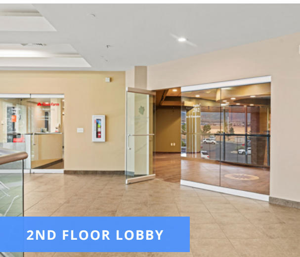
2ND FLOOR LOBBY